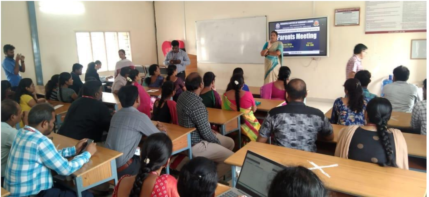
Few Mentors are interacting with parents explaining in the academic's side, attendance details, subject related work with the parents.